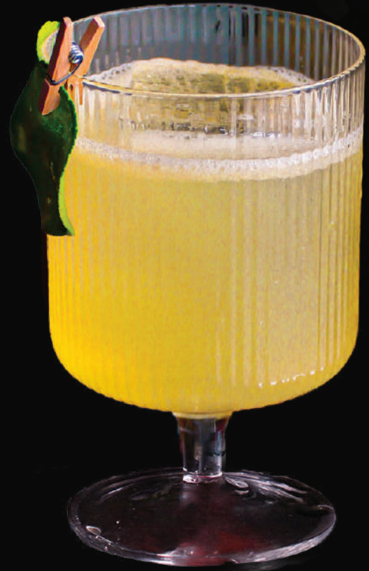
Điện Biên Phủ

*Prices are subject to 10% VAT and 5% Service Charge