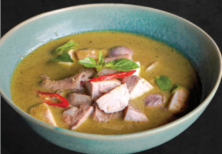
Green Curry With Free Range Chicken

Grilled catfish, Thai herbs, smoked chillifish sauce, lime, chilli