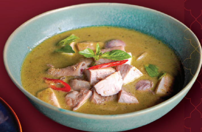
Green Curry With Free Range Chicken ✦